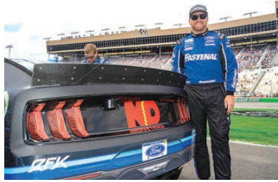
6, 2022, at Phoenix Raceway in Avondale, AZ, USA. www.ndindustries.com

The NASCAR Cup Series Championship takes place Sunday, November