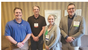
NFDA Executive Committee 2025-2026.